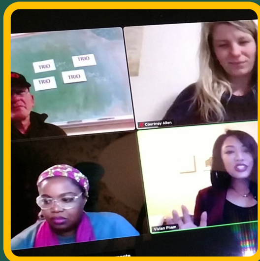
TRIO Alumni Speak at TRIO Day

"TRIO is the first place I go to when I need support. I know they have my back! Just knowing I have access is a relief."