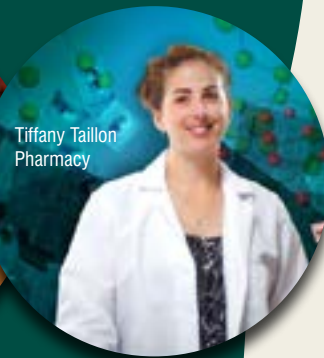
Tiffany Taillon Pharmacy

Outstanding career-focused and experiential programs that will launch young adults into a successful future.